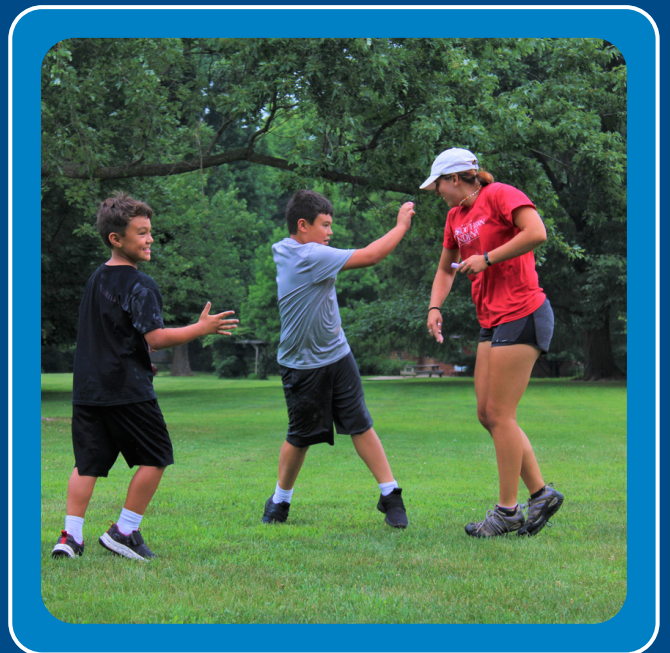
SPORTS & REC