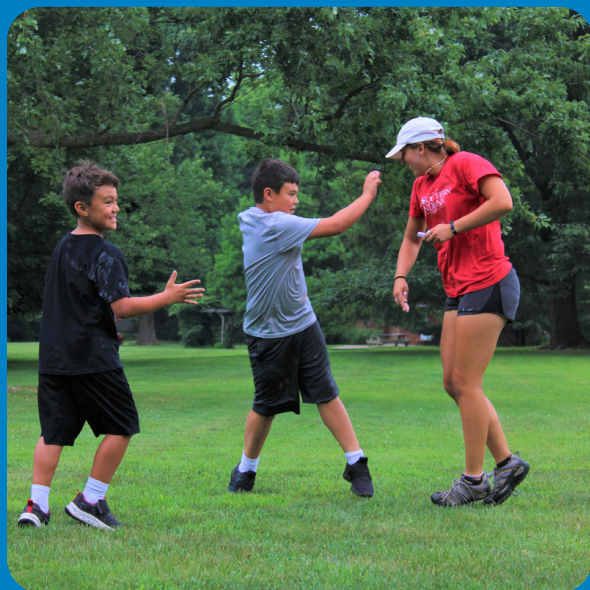
SPORTS & REC